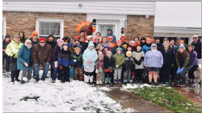
Runners and walkers gather for a pre-race photograph.