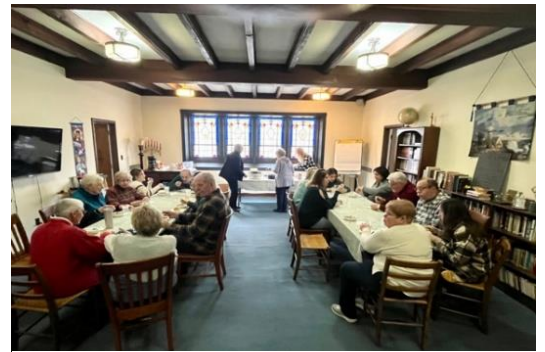
The well-organized crew enjoying fellowship and lunch after decorating the sanctuary.