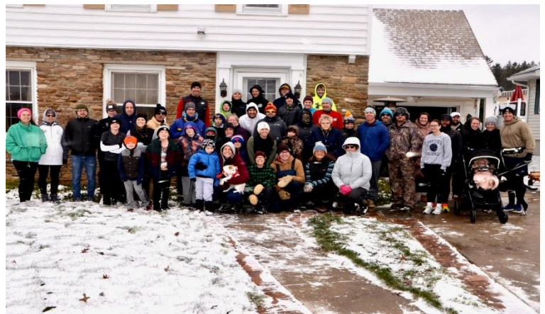
This year's Turkey Trot Participants.