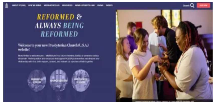
The new PCUSA home page ( pcusa.org ).

From a technology perspective, the redesign provides for more flexibility, more frequent updates and changes with a reduced amount of technical effort. For users, the new website is designed to be more topic driven, easier to navigate and with an improved search feature. Check out the new website; the design team welcomes your feedback!